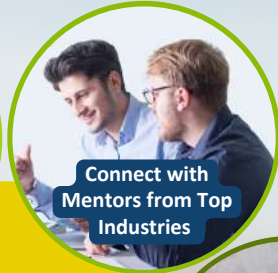
Connect with Mentors from Top Industries