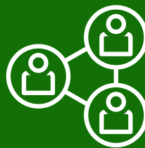
Connect with Colleges All over India