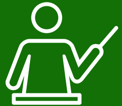
Learn From Industry Leads

On Your Mark --> Get Set --> TIFAN Twenty24