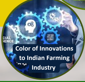
Color of Innovations to Indian Farming Industry