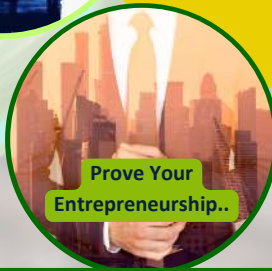
Prove Your Entrepreneurship..