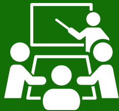
Trainings from Technological Clients