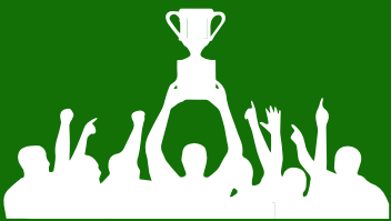
Work Together, Win Together