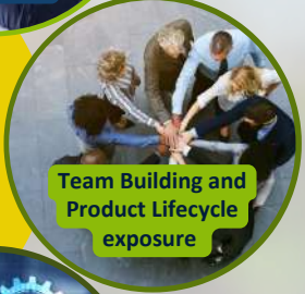
Team Building and Product Lifecycle exposure